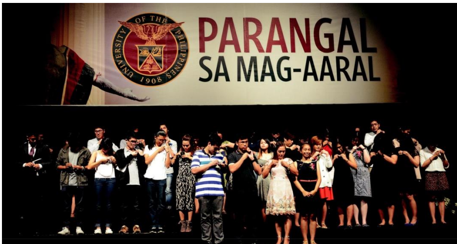
Parangal para sa mga Mag-aaral 2017

The effectivity of the scholarship is for the semester when such weighted average is obtained.