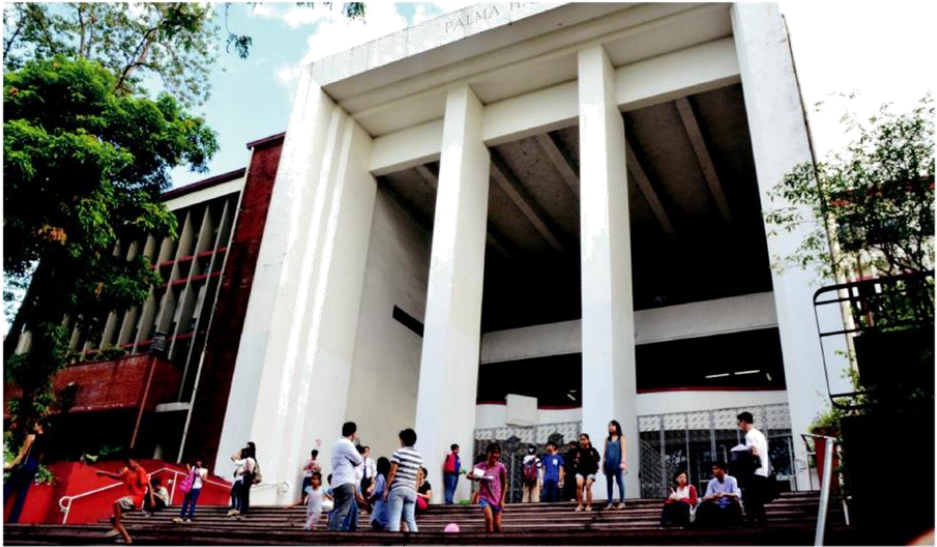
College of Social Sciences and Philosophy