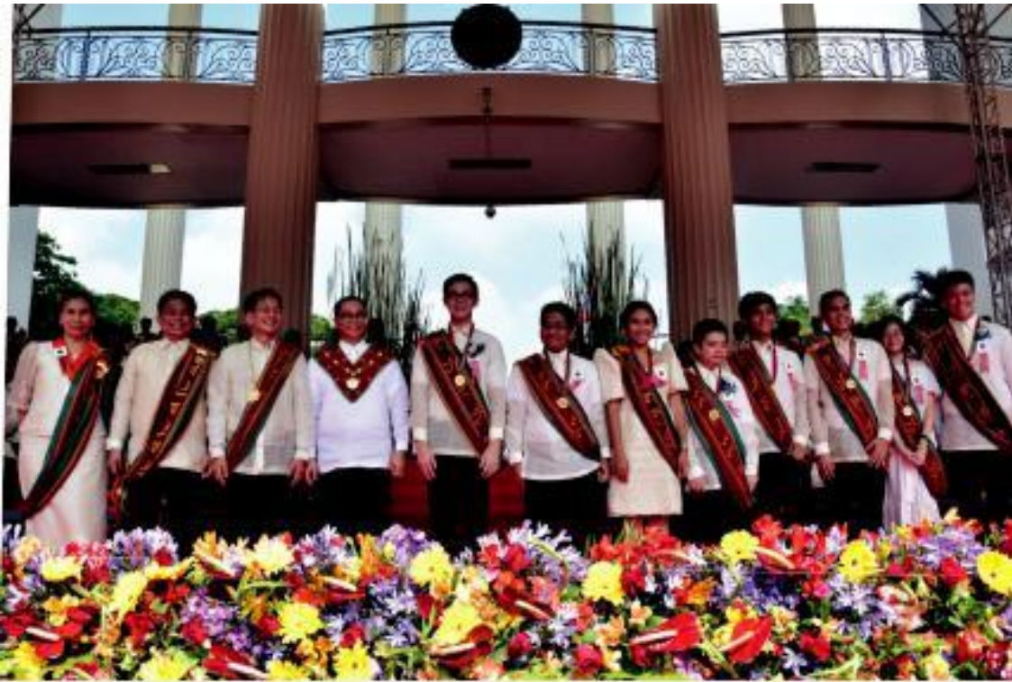
106 th General Commencement Exercises

Students who complete their courses with the following ABSOLUTE MINIMUM weighted average grade shall be graduated with honors: